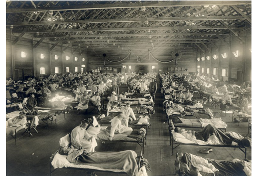
Temporary influenza ward

Several presentations focus on specific topics, such as the role of health care workers during the 1918-1919 pandemic.