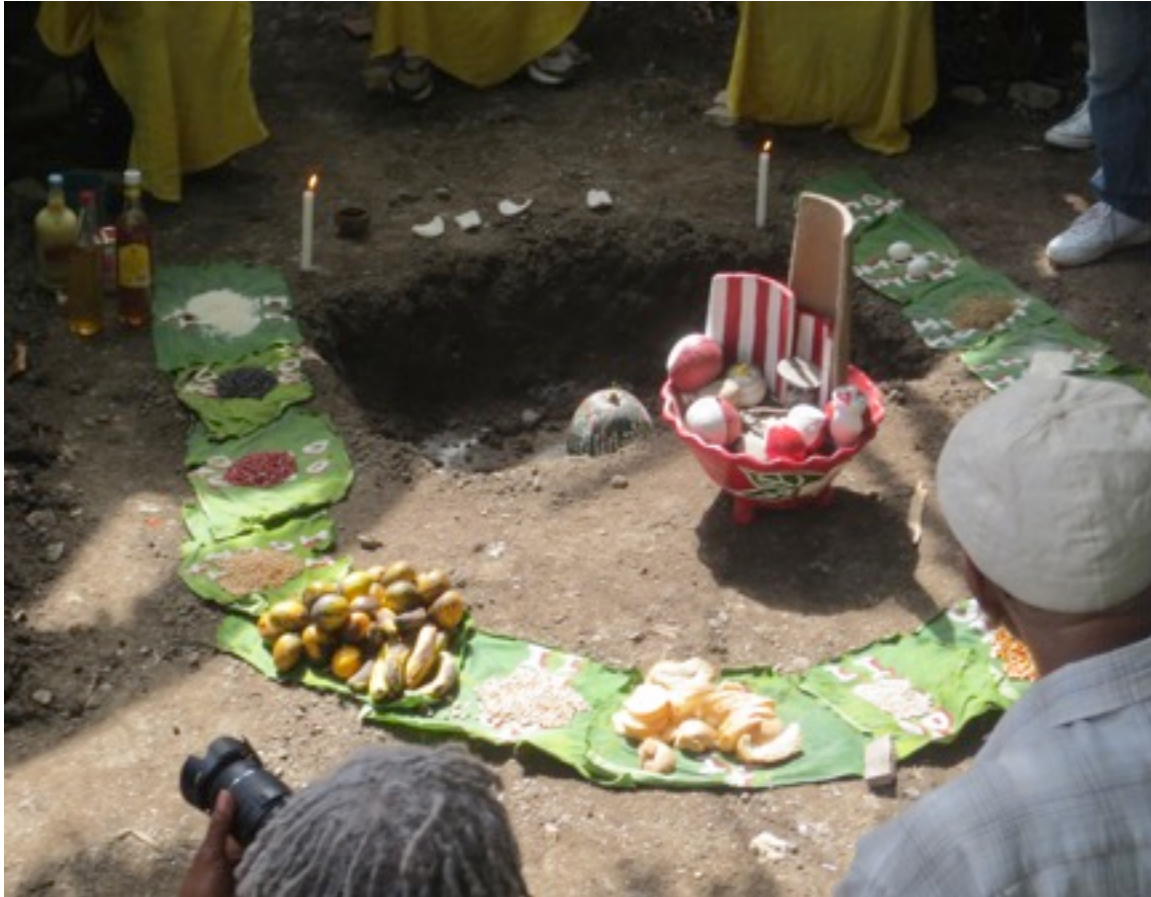
Pictured: Santeria ceremony involving fruit and eggs.