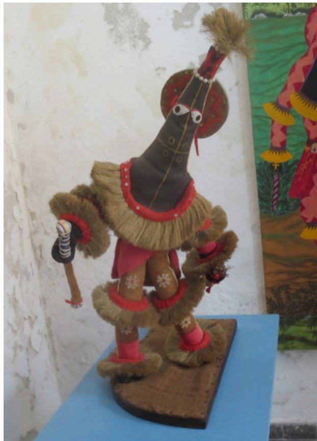
Pictured: Cuban Doll