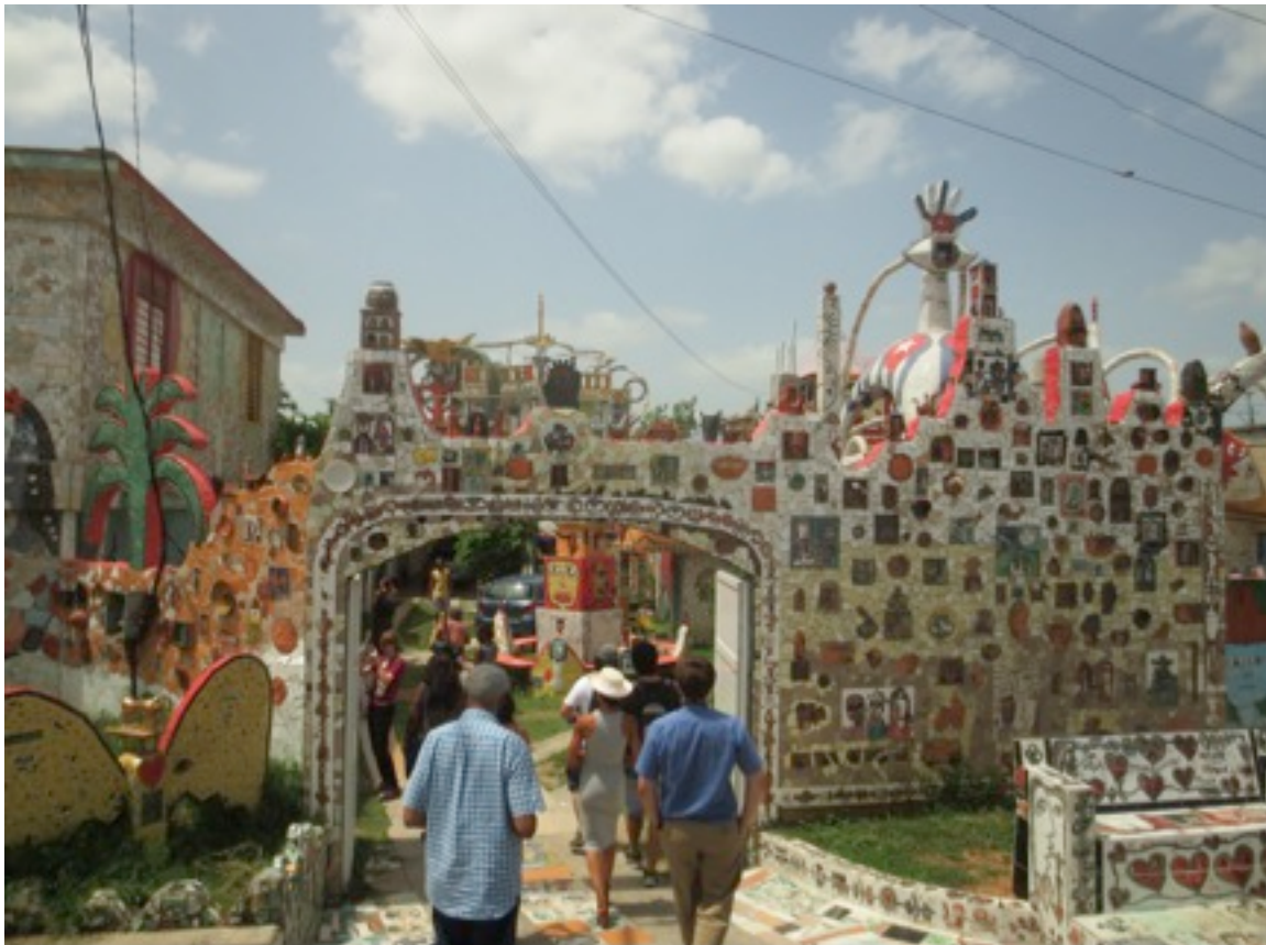
Pictured: Top picture is a Mosaic wall and bottom picture is a mosaic entrance in Santiago