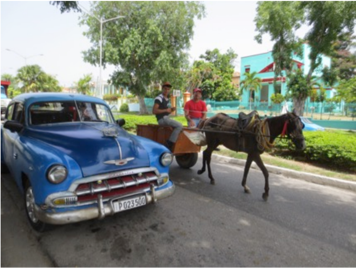
Pictured: Streets of Cuba – Old car and Horse with trailer