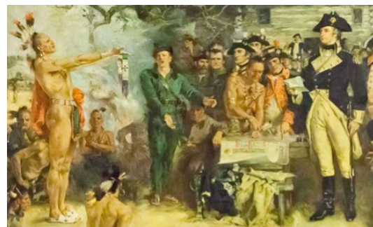
Howard Chandler Christy's 1945 rendering of wampum exchange at Greenville (detail): Little Turtle (left) presents a wampum belt to Anthony Wayne (right).