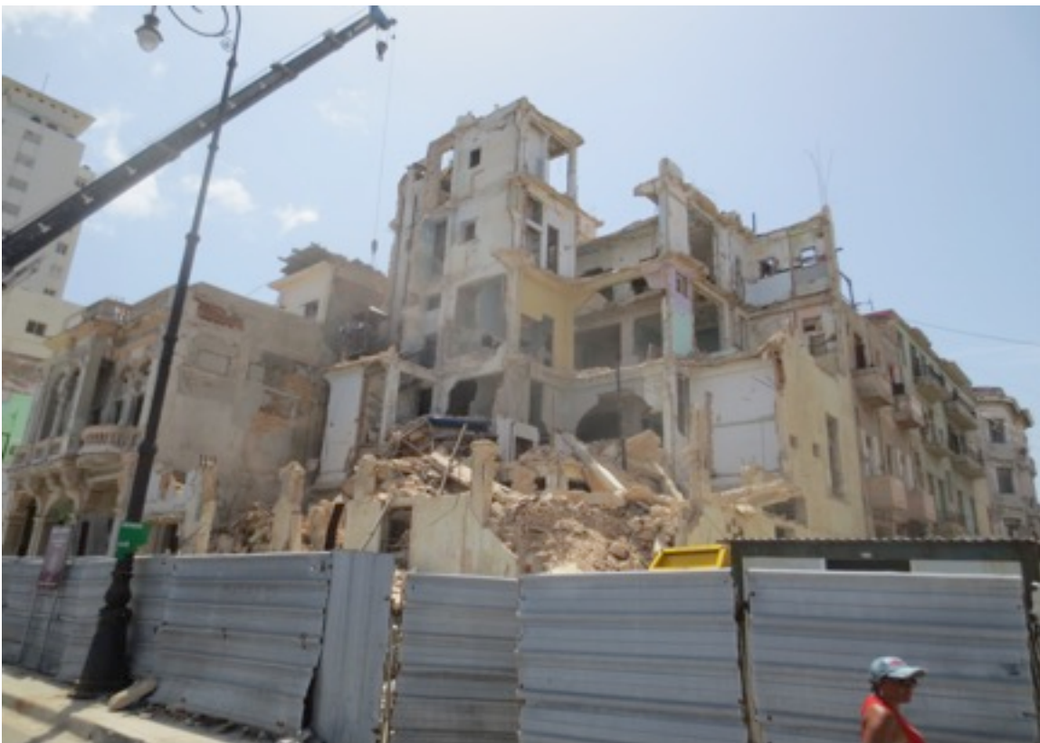
Pictured: Torn down building in the aftermath of a hurricane.